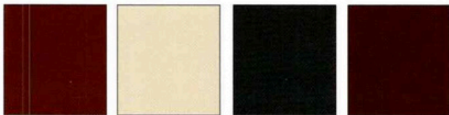
195-9 ENGLISH COTTAGE 195-10 PARIS PEARL 195-11 JET BLACK 195-12 ENGLISH MANOR ROSE