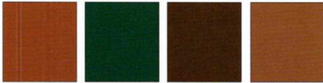
195-1 SPANISH TILE RED 195-2 BLACK FOREST GREEN 195-3 STONEHENGE 195-4 BERLIN BROWN